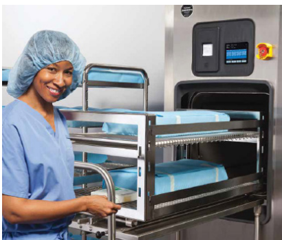
Sterilizer for medical device reprocessing $42,000

This cutting-edge camera offers sharper images that provide truer-to-life clarity and colour, giving surgeons a better look at the fine details – so important during minimally invasive surgical procedures. Although the equipment being used right now is fully operational, meeting our needs, and completely safe, it is essential that it be replaced to keep up with developing technology. The SMH is