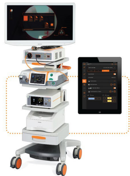
Laparoscopic/arthroscopic tower (camera and monitor) $67,000