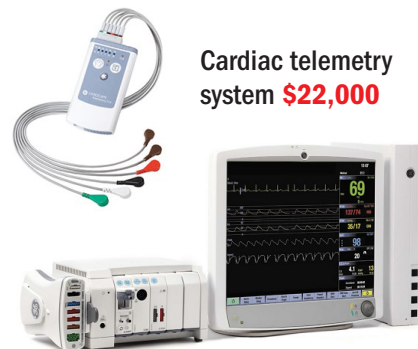
Cardiac telemetry system $22,000 Anesthesia monitoring equipment $41,000