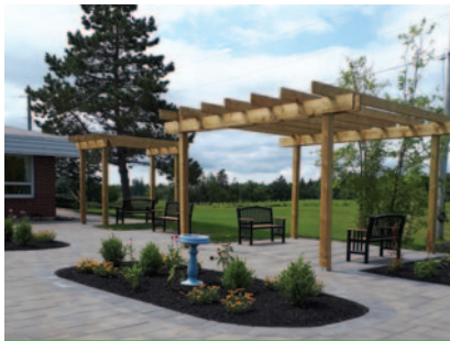
Serenity Garden at Westford Nursing Home.

Funding was also provided to EOS Eco-Energy for Climate Change Stress Group Counselling . Workshops are offered to the general public and for