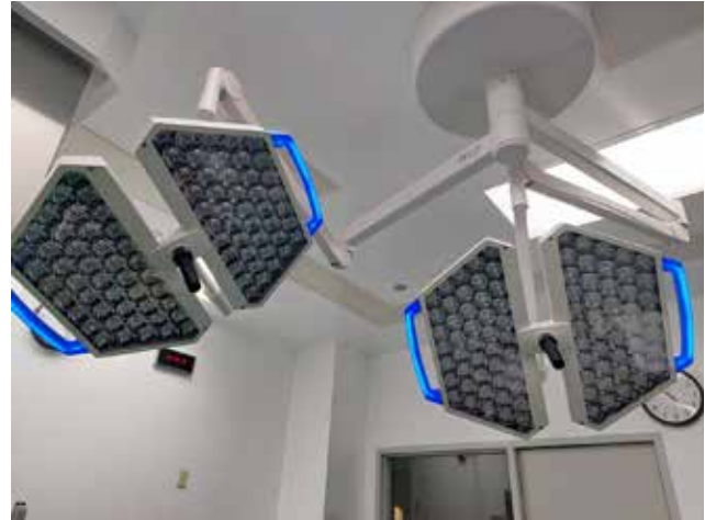
Overhead Lights in the Operating Room

This new system provides a way to monitor a patient's cardiac rhythm remotely and during any patient activity.