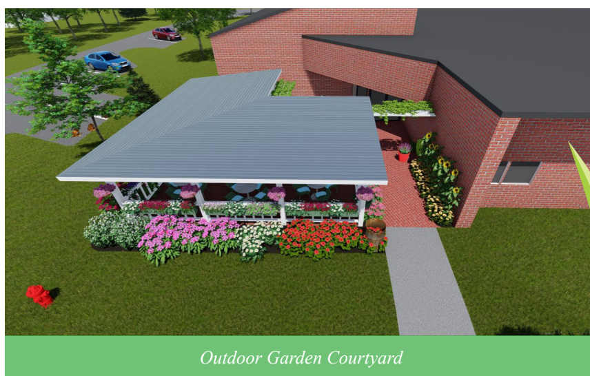
Outdoor Garden Courtyard

The courtyard will offer multiple benefits to patients, such as reducing stress and anxiety, and supporting recovery, while addressing their emotional and social needs. Just having access to sunlight is proven to help ease mild depression and improve sleep quality.